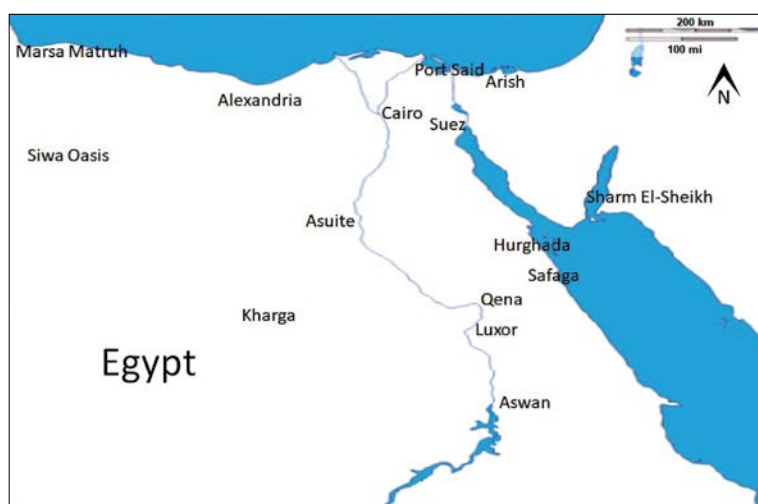
Fig. 2. Map Showing the location of the studied cities in Egypt.

increases for persons who spend more than 80% of their time indoors in either the home or the workplace 12) . Radon concentrations in dwellings depend on a number of parameters such as building materials, geology, living environment, ventilation, climate and so forth 3, 13) .